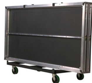
6 Deck Vertical Cart