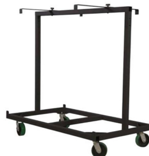
8 Deck Vertical Cart