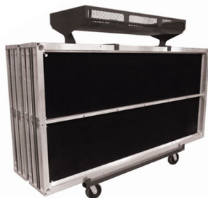
6 Deck Vertical Cart With Basket