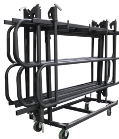
Vertical Guardrail Cart