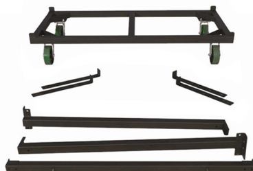
Easy To Assemble Bolt Construction